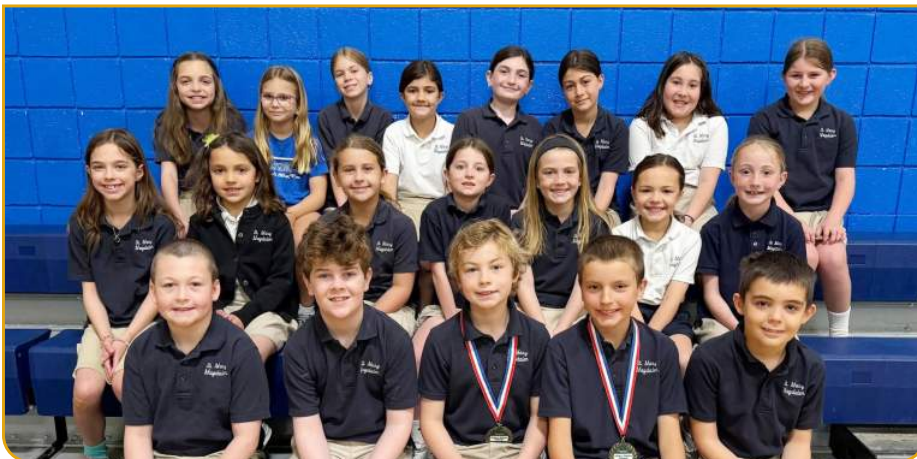
Our 3rd graders earned the Innovation Award at the COHS Coding & Robotics Challenge!