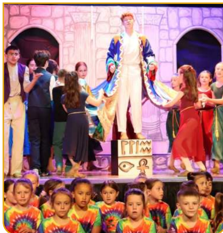
Scenes from the Theater Program's 'Joseph and the Amazing Technicolor Dreamcoat'.