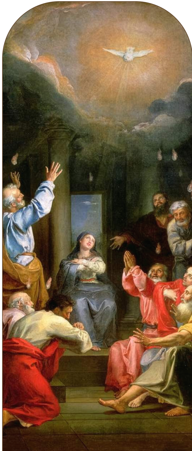
Louis Galloche, The Descent of the Holy Spirit (1732)