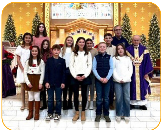
Some of the winners of the Knights' "Keep Christ in Christmas" essays and posters contest.

The Gathering Room, located off the Narthex, will be closed from Monday, January 8, through Monday, January 15 , to replace the floor tiles. If you have a meeting scheduled, please check with your group about any changes in your meeting location.