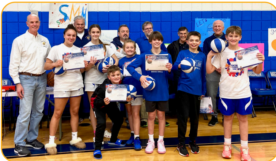
The Winners of the Knights' Annual Free Throw Contest last Saturday.