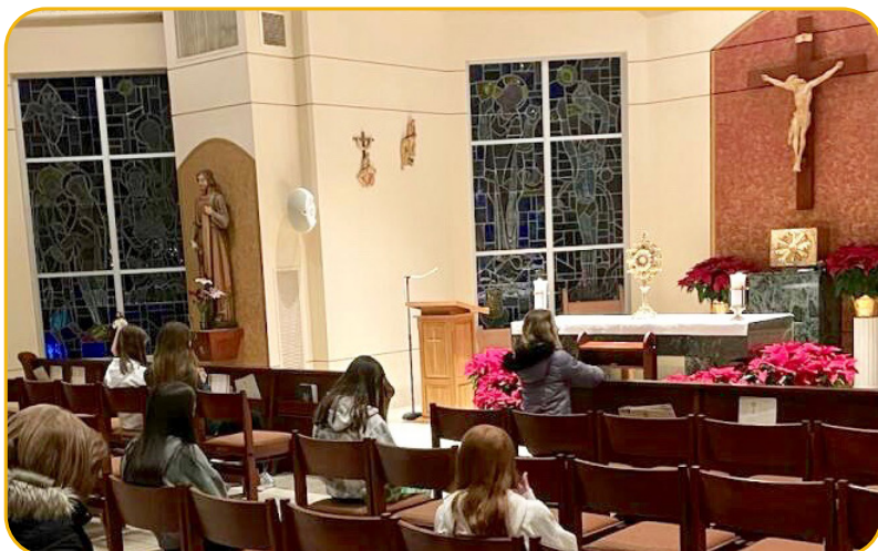
PREP students spend time with Jesus in Adoration.

Passionate Catholics believe our heavenly Father created us to know, love, and serve Him with reverence. As Catholics, we must respect each other as His precious children by sacrificing our lives to protect and defend human life. Our Parish Mission unites our minds and hearts to "Build a family of faith in Jesus Christ through Catholic Worship, Formation, and Charity." Do you believe human life begins at conception and continues to eternal life? Our state representative sent a survey asking us to vote on whether we "should protect a women's right to abortion?"