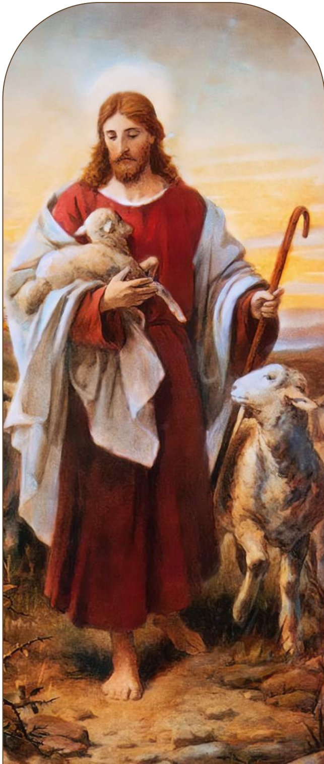
Bernhard Plockhorst, The Good Shepherd (1878)