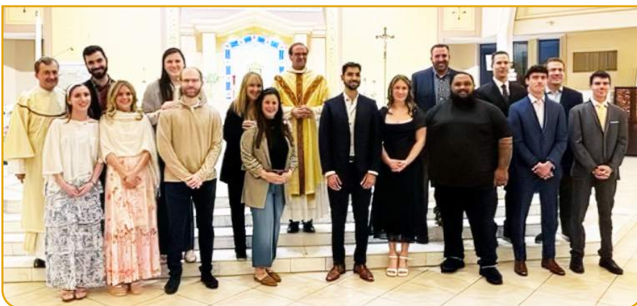
Our eight OCIA adults who were confirmed on Divine Mercy Sunday and their sponsors.