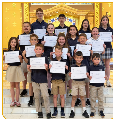
Congratulations to our Disciples of Jesus Award recipients for March and April!