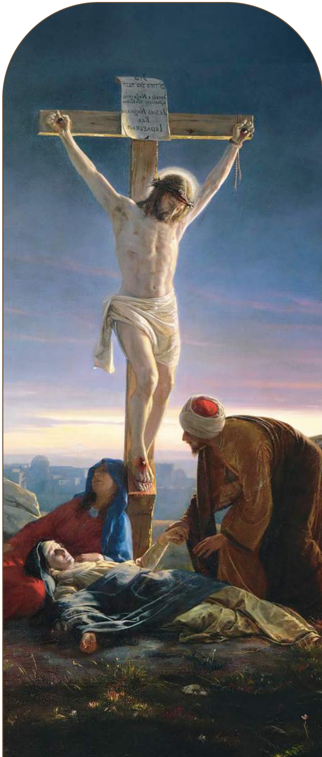
Carl Bloch, The Crucifixion (1870)