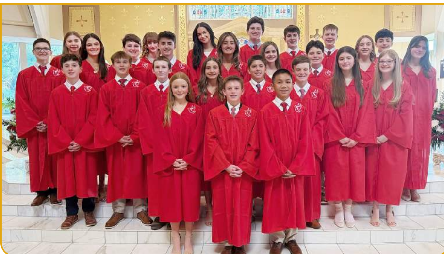
Congratulations to the 7 th grade SMM students who received the Sacrament of Confirmation!