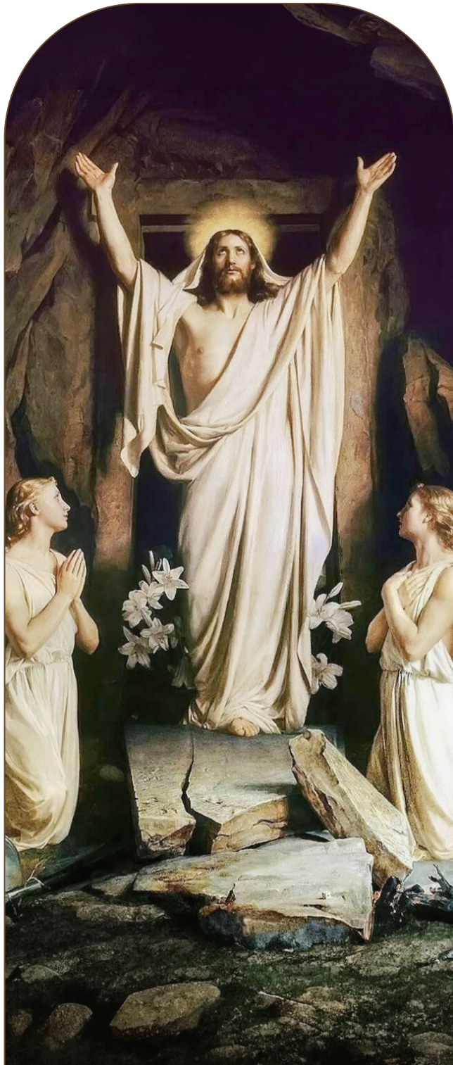
Carl Bloch, The Resurrection (1887)