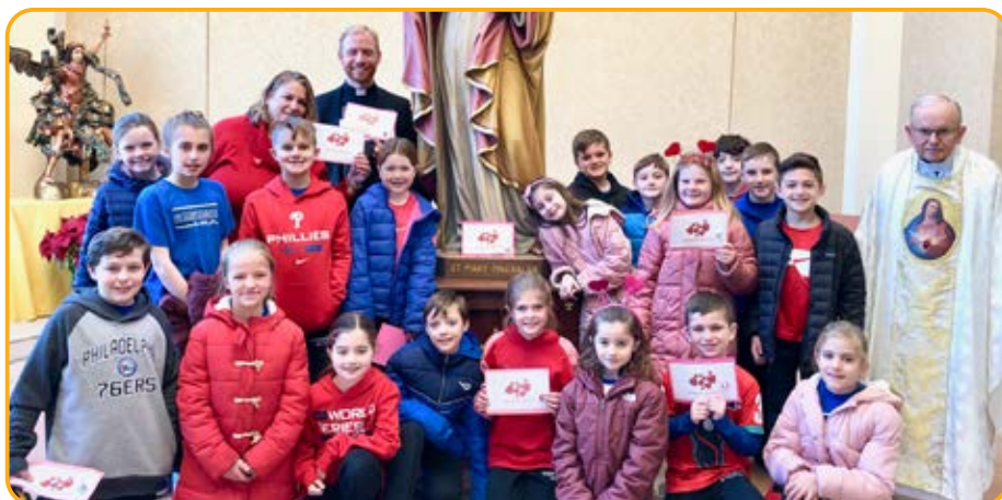
Third grade offers Valentine blessings during Mass on St. Valentine's Day.

Please consider donating NEW pairs or packs of socks for men, women, or children to aid area homeless and underprivileged. In collaboration with The Joy of Sox® program, we will collect and distribute needed socks to shelters throughout Philadelphia. The Joy of Sox suggests dark-colored cotton crew socks with a reinforced toe and heel. There is a specific need for adult sizes, but we gladly accept all new sock donations. Collection boxes will be available in the Narthex and the gym lobby. We thank you for your generous hearts.