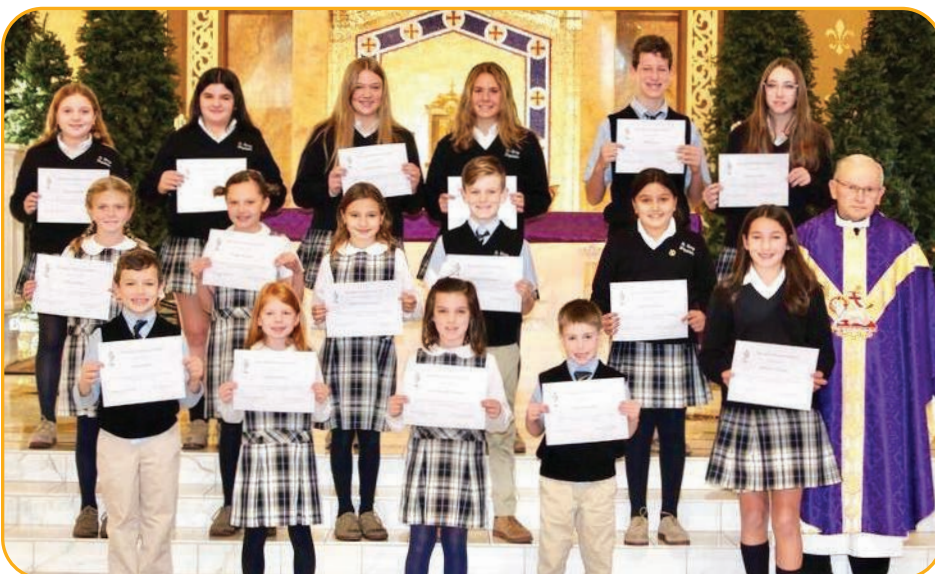
Disciple of Jesus awards for practicing the virtue of Stewardship.

Congratulations to our newly baptized! For baptismal information, call Ext.107.