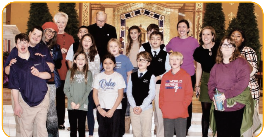
The Father Bill Atkinson Service Corps visits the school.