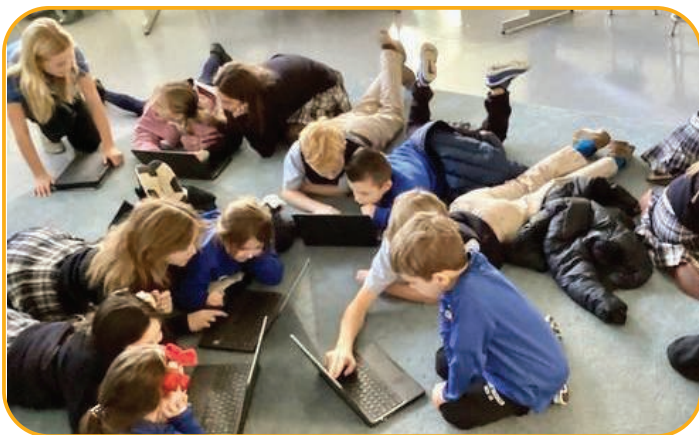
5th grade and Kindergarten working together!