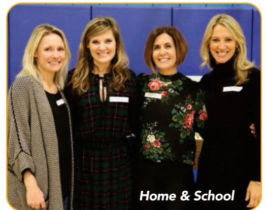
Home & School