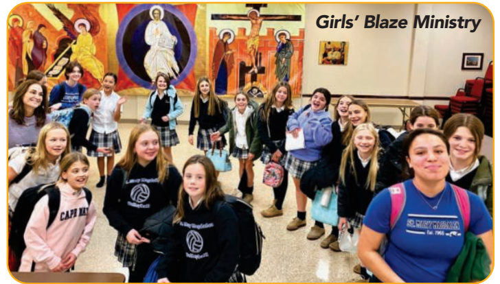
Girls' Blaze Ministry

ALL ARE WELCOME! ✦ 2400 N. PROVIDENCE ROAD ✦ MEDIA, PENNSYLVANIA 19063