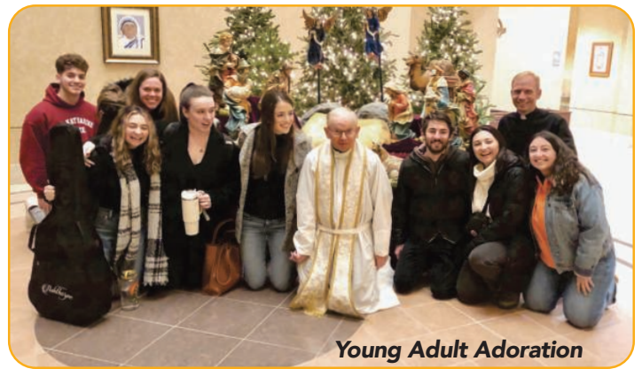
Young Adult Adoration