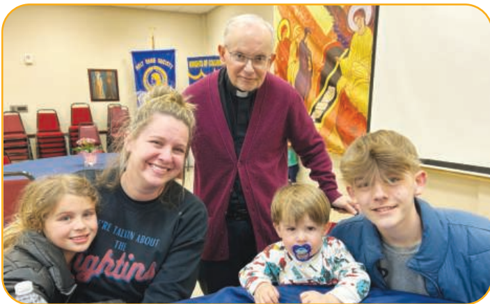
Family and friends enjoy the Knights' Simple Supper.